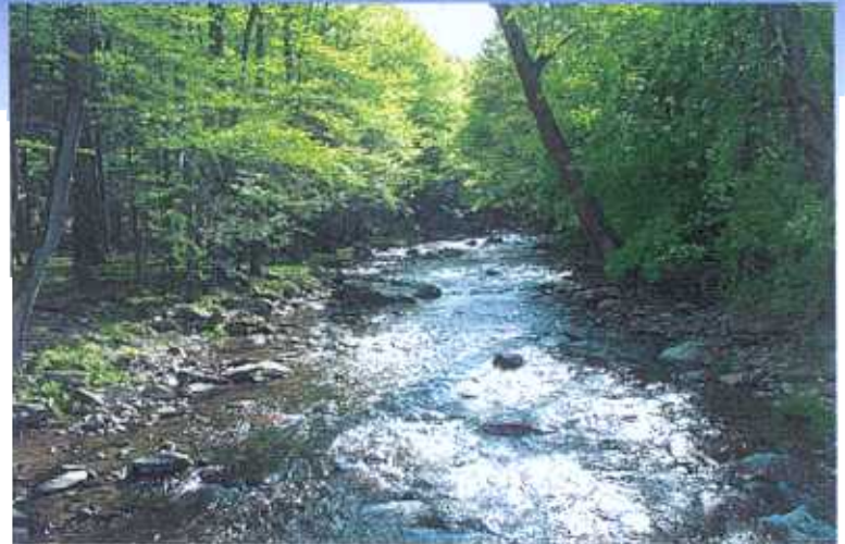
The Conewago Creek as it passes through the scenic Narrows northwest of Arendtsville.

Conewago is an Indian word (either Lenape or Iroquois) meaning "at the place of rapids". In 1734, William Penn authorized licenses to people wishing to take up land west of the Susquehanna River. About 20 licenses were issued for about 8,000 acres of land along the upper reaches of the Conewago Creek and its tributaries in the northern part of what is now Adams County. Many of these licenses were granted to Scotch-Irish immigrants. The first settlers moved into this area because it was at the intersection of two important trails; one